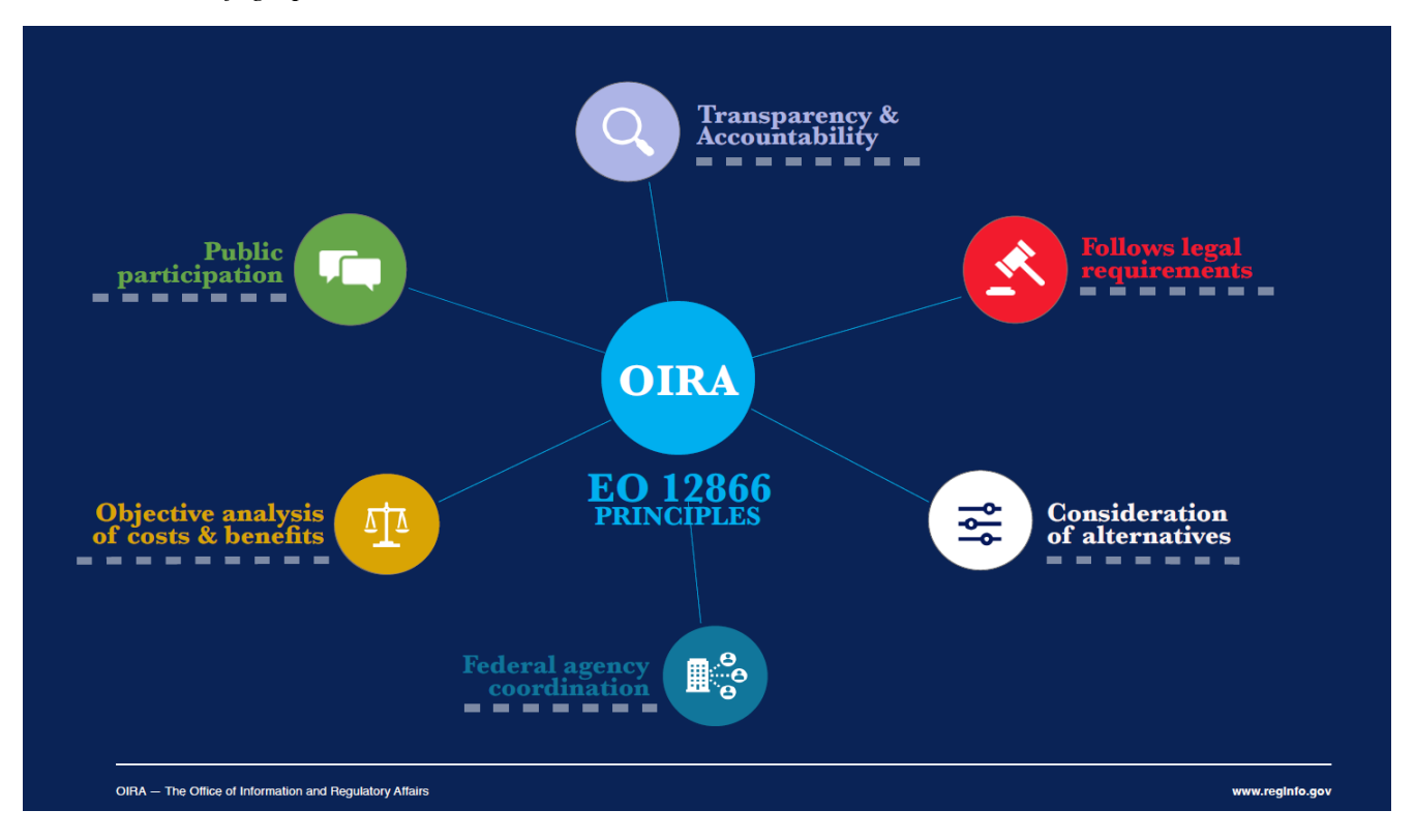
Slides 13-14: [infographic with voiceover]

VOICEOVER: Federal regulations address a range of important issues and can affect many parts of our daily lives. Some rules are considered more impactful – or significant – than others.