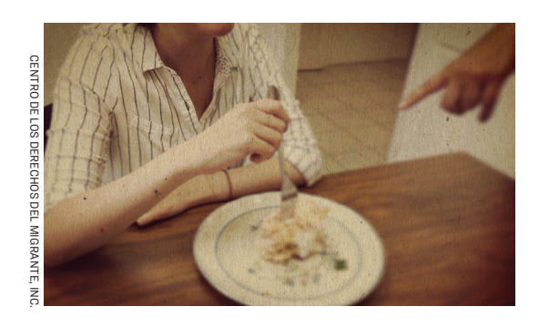
Some au pairs are not allowed basic fresh food and are only allowed to eat leftovers.

As a general matter, au pairs report that the program fails to guarantee access to the basic material needs and services promised under the J-1 au pair program. Despite program requirements that host families guarantee transportation to classes, 65 some au pairs interviewed for this report stated that they did not have access to transportation to attend their required classes or to leave the house on their days off. 66 Although host families are also required to provide au pairs with a private bedroom and meals, 67 some au pairs reported that their host families offered them shared or inadequate living quarters.