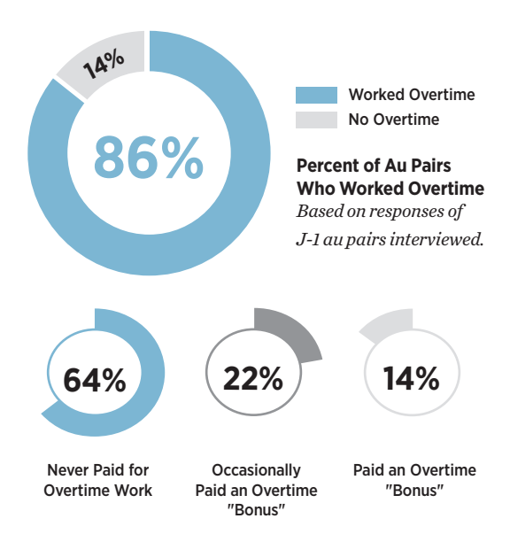
"Bonuses" included extra food, gift cards, and sub-minimum wage payments.

The Court additionally found that the au pairs have a viable claim against the sponsor agencies for wage fixing and recently certified a class of over 91,000 current and former au pairs to proceed with that claim. <sup>63</sup> The court also certified classes under the Racketeer Influenced and Corrupt Organizations Act (RICO), state minimum wage laws and state fraud rules. <sup>64</sup> The au pairs are also proceeding collectively with federal wage and hour claims under the FLSA's collective action mechanism.